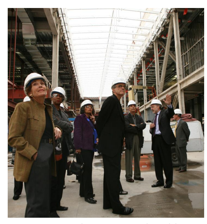
Campaign donors on a hard hat tour of the Modern Wing