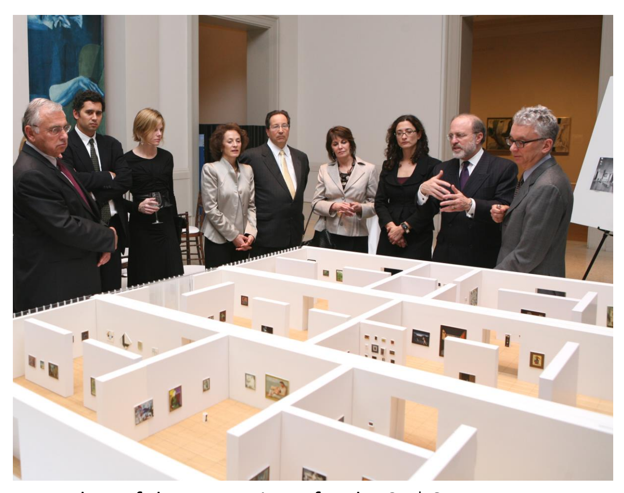
Founders of the Art Institute for the 21st Century with a model of the third floor of the Modern Wing