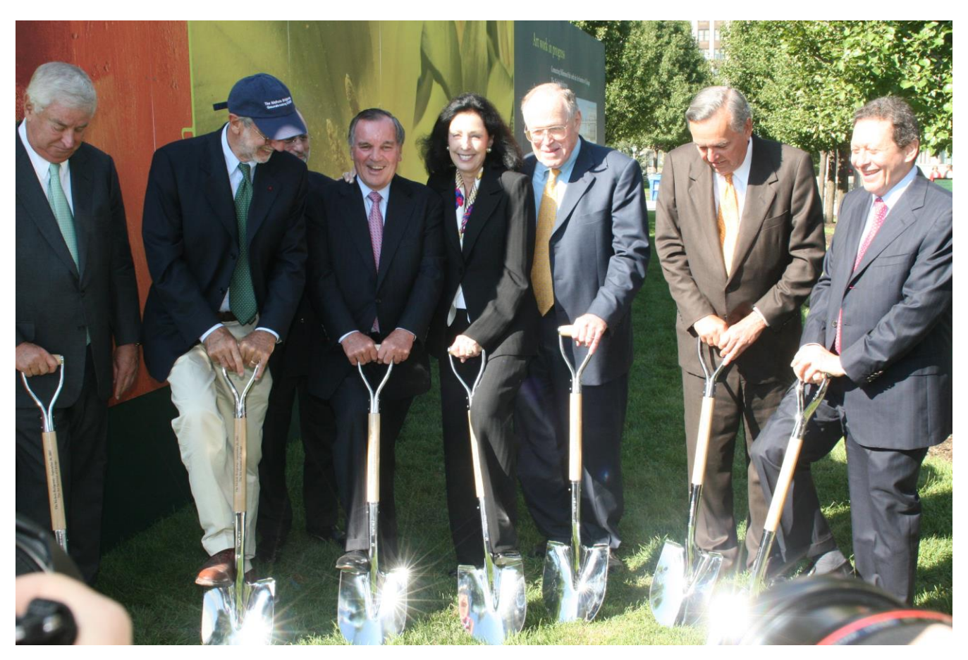
Groundbreaking for the Nichols Bridgeway, Millennium Park, September 20, 2007