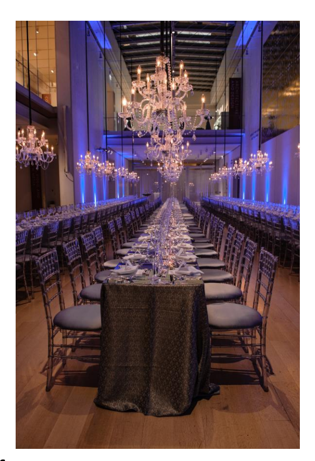
The opening of reception and dinner for the Edlis | Neeson Collection and The New Contemporary December 10, 2015