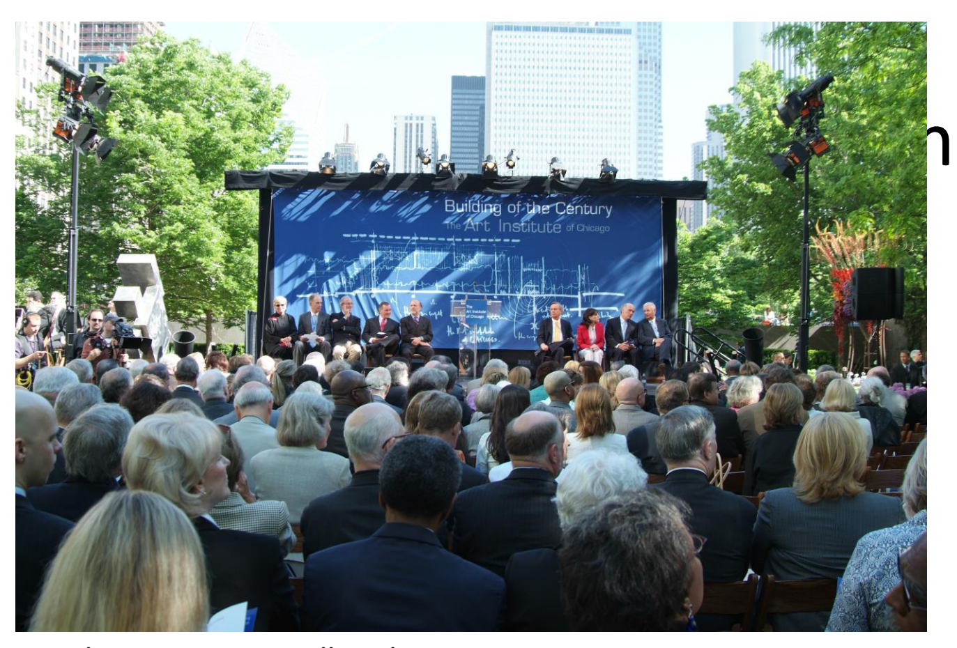
Modern Wing Groundbreaking, North Stanley McCormick Court, May 31, 2005