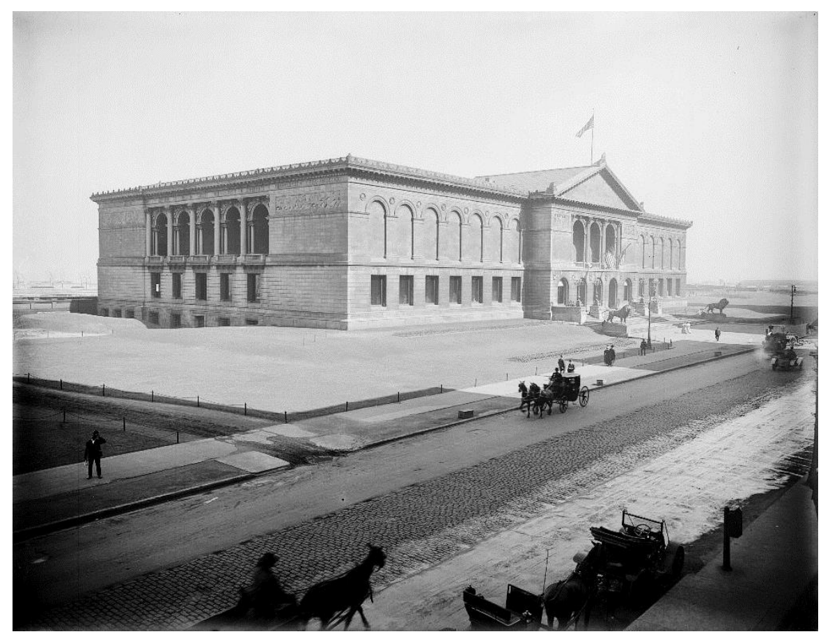
Art Institute of Chicago, c. 1900